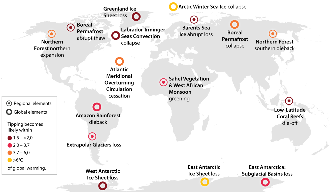
Fig. 1. A map of climate tipping elements, i.e., Earth system subdomains that determine the state of the climate system and are susceptible to dramatic change if global warming crosses threshold values corresponding to their tipping points. The ranges of global warming values where a tipping point is found for a specific tipping element are presented in colors (yellow for <2 °C, orange for 2 to 4 °C, and dark red for ≥4 °C). The map is derived from Armstrong McKay et al. (6) and printed with permission from the American Association for the Advancement of Science. See SI Appendix, Glossary for key definitions.

Crossing the tipping points will not only have environmental implications as their structure and functioning change (e.g., from stable to erratic regional rainfall) but is also likely to disrupt socio-economic and political systems that have developed with and are reliant on the stability of the Holocene (23). For instance, around 400 million people would directly suffer from a demise of tropical corals (51), and at 3 °C of global warming, over three billion people would be living in regions with health-threatening levels of heat (52). The same is true for the planetary boundaries, which, despite critique (reviewed in ref. 53), are considered precautionary “scientific assessments about what is safe, dangerous and unacceptable” (54, p. 83). Transgressing boundaries and undermining the functioning of biophysical systems already have severe multispecies justice implications for present and future